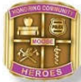
Moose Legion Pin