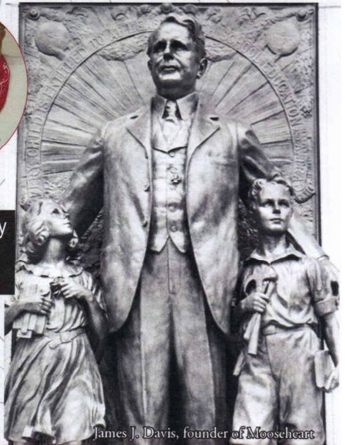
James J. Davis, founder of Mooseheart

Please wear your Donors Circle pin proudly and share the story of Mooseheart & Moosehaven at every opportunity.