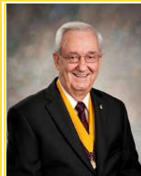
Supreme Governor Howard Kitchens