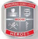
Lodge & Chapter Pin